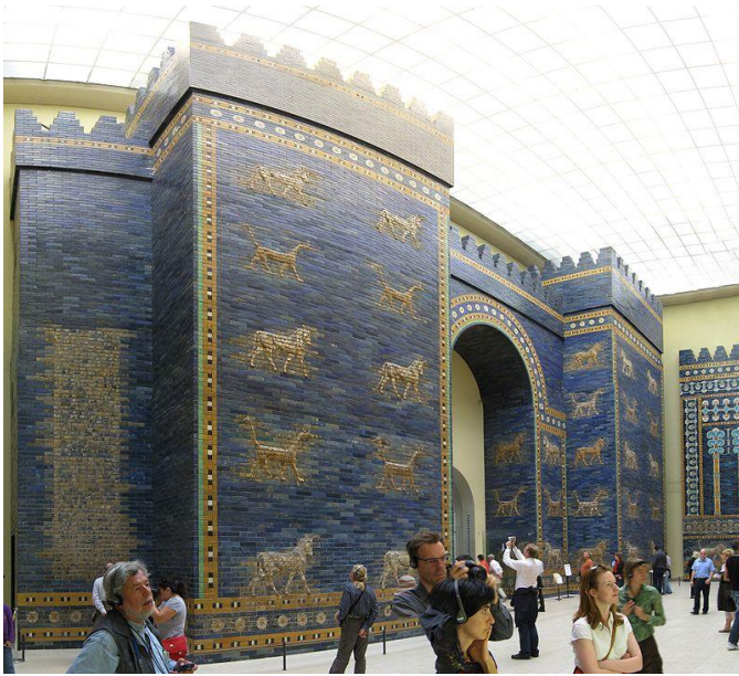
< Babylon’s Ishtar Gate

On Thursday morning your guide will escort you to the Kulturforum , the cultural hub of the western part of the city, with prestigious institutions such as the new Berlin Philharmonie, the State Library, and - our objective this morning – the Gemäldegalerie , Berlin’s world-famous Picture Gallery, which features paintings from just about every style and period. Our visit may also include an opportunity to take an exclusive look at some famous lithographs and sketches by the likes of Dürer, Brueghel, and Rembrandt! For lunch we recommend the Picture Gallery’s excellent cafeteria. In the afternoon you may want to return to the museums of the Museum Island, or you can simply continue just next door to the New