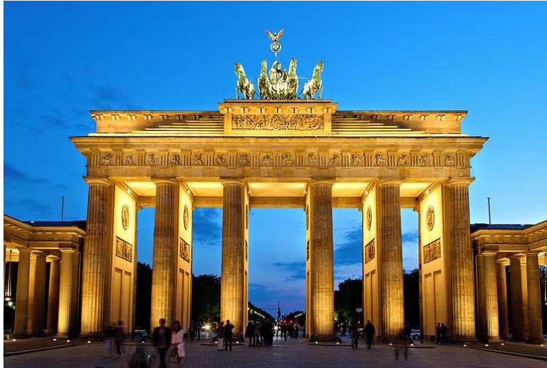
The Brandenburg Gate at sunset

Pauwels Travel Bureau Ltd. 55 Dufferin Avenue, Brantford, Ontario N3T 4P6 Tel: (519)756-4900 Fax: (519)753-6376 www.pauwelstravel.com - tours@pauwelstravel.com