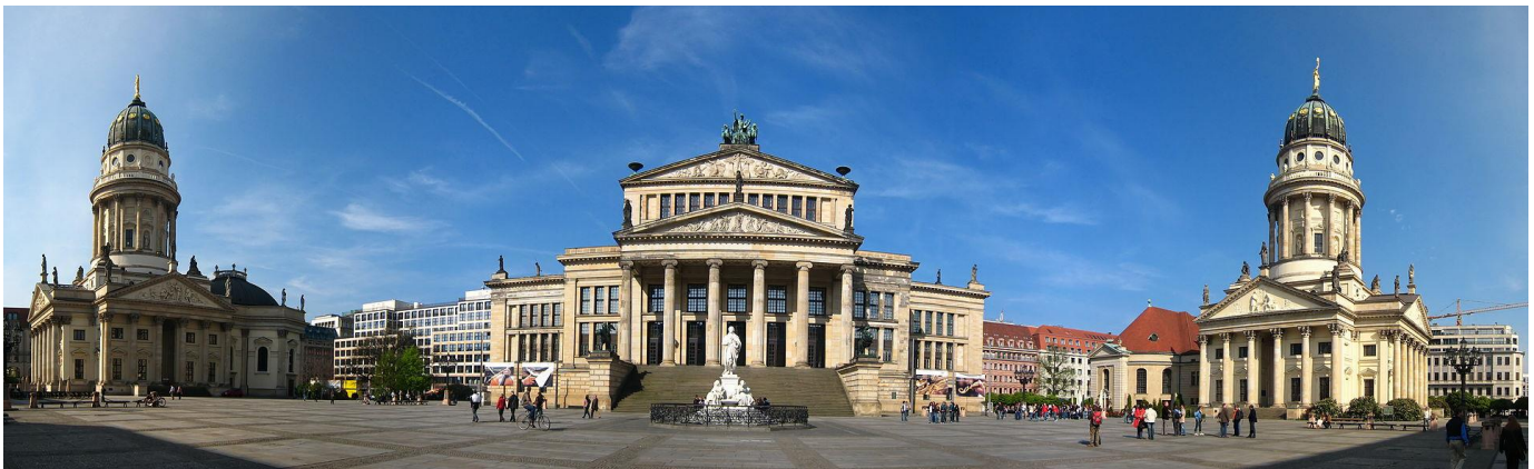
Panoramic view of Berlin's Gendarmenmarkt